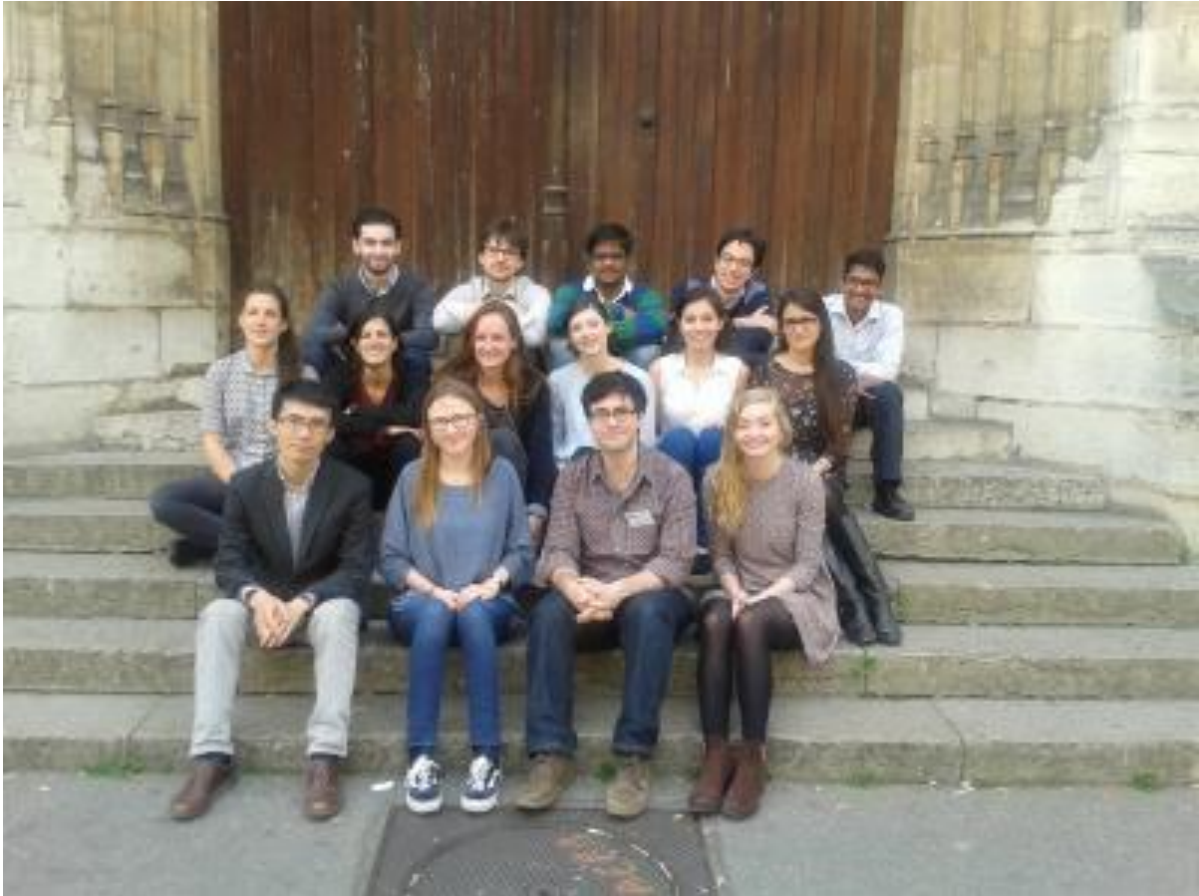
The fifteen international candidates invited to take the auditions in Paris to enter the 2015 ENP Graduate Program, on the steps of the Réfectoire des Cordeliers.